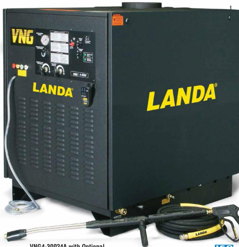
VNG4-30024A with Optional LanCom Wireless Remote

■ Insulated, fatigue-free Trigger Gun with stainless steel, dual-lance Variable Pressure Wand make for easy cleaning and adjusting the pressure while washing.